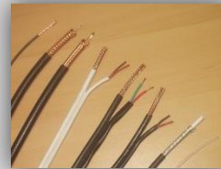
Coaxial Cable, Power-Ax & LMR Type (MIL-C-17 & commercial grade)