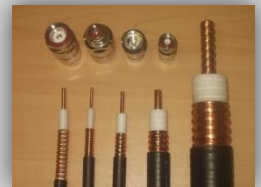
Low Loss Foam Filled Coaxial Feeder Cables & Connectors