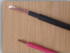
Single Core Double Insulated Cable, Silicone Insulated Wire: 180°C-250°C