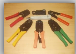
Crimp Tool, Cable Stripping Tool, Punch Down Tool, Earthing Kits, Jumper Leads, etc.