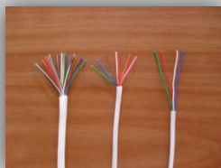
Comm.'s Cable (Solid or Flex), HT Cable