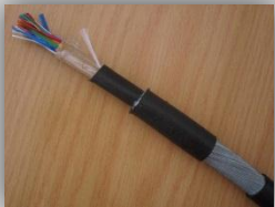
Telephone Cable: Indoor, Outdoor & Armoured