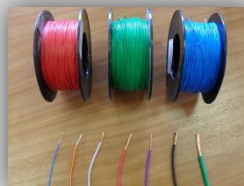
Panel Flex Wire. High Temperature Wire. Ripcords.