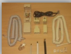
Flat Modular Telephone Cable and Accessories