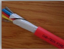
Fire Resistant Cable (SANS 10139 – PH30 to PH120)