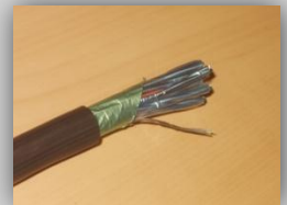
Individual & Overall Foil Screened Cable