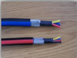
Multi-core Unscreened Armoured Cable. Pull Key Cable.