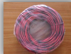
Blasting Wire. Auto Wire. Underfloor Heating Wire.