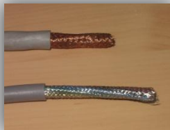
Multi-Pair & Core Copper Braid Screened Cable