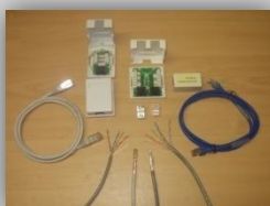
Cat. 5e & Cat. 6 Cable and Accessories (LAN cables are EC &/or UL verified)