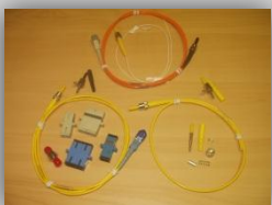
Fibre Optic Cable and Accessories (HDD, CST, LCD OPGW)