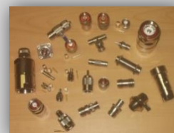
Connector Range: Sub-D, IDC, Ribbons, BNC, TNC, SMA, UHF, N Type, 7/16 DIN, etc.