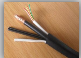
Cable can be custom made to customer specifications