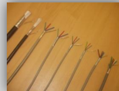
Multi-Pair & Core Overall Foil Screened Cable